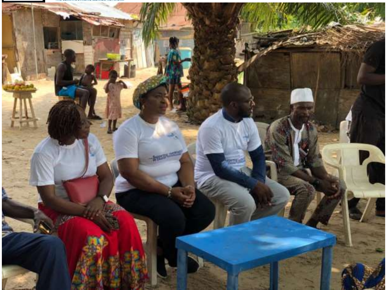
AFMESI TEAM AND COMMUNITY BAALE BEFORE THE CLEANUP