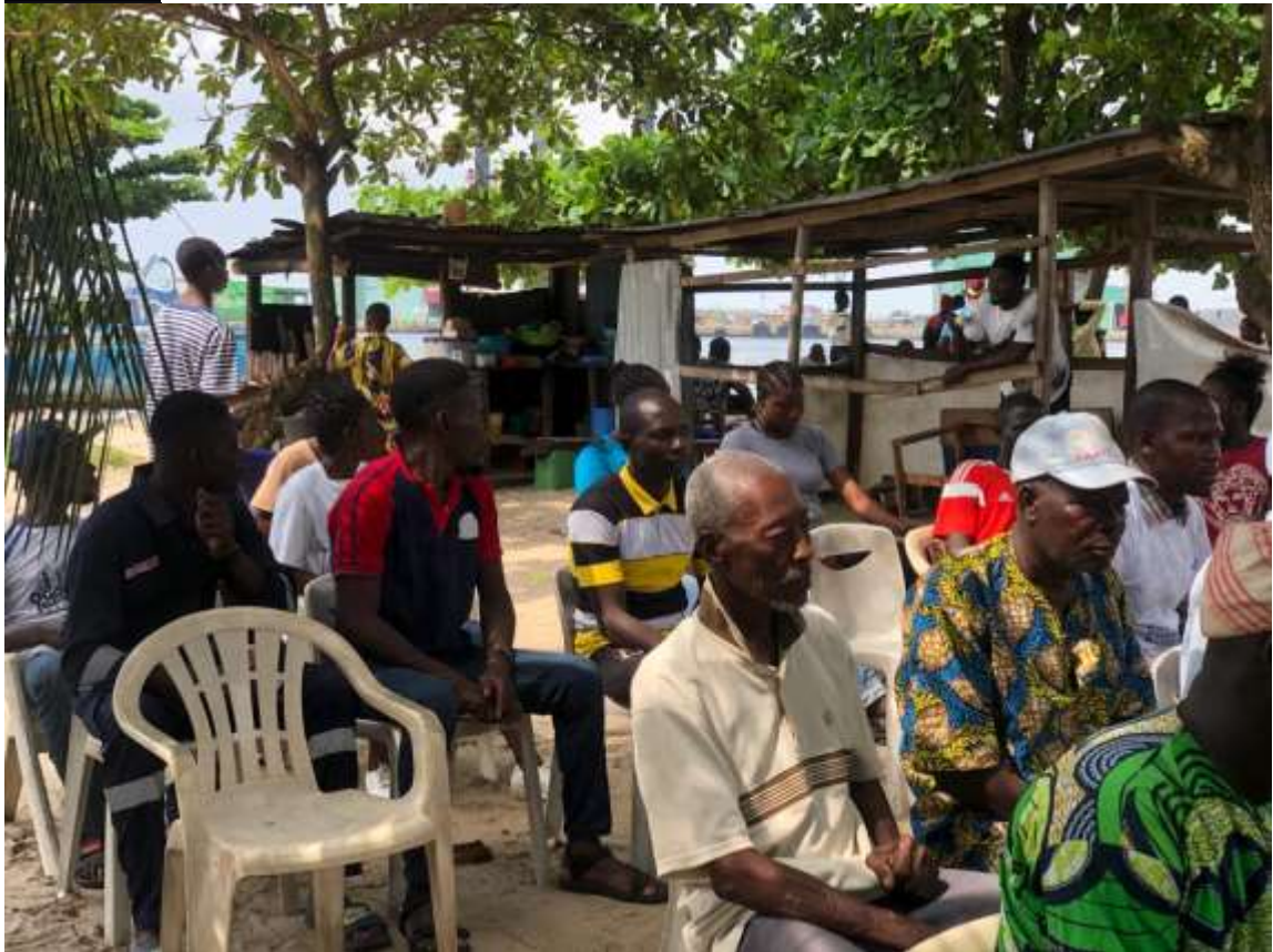
MEMBERS OF THE COMMUNITY DURING THE CHAT SESSION