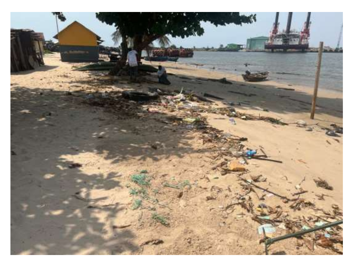
PICTURE TAKEN BEFORE THE CLEANUP EXERCISE TAKEN BEFORE THE CLEANUP EXERCISE