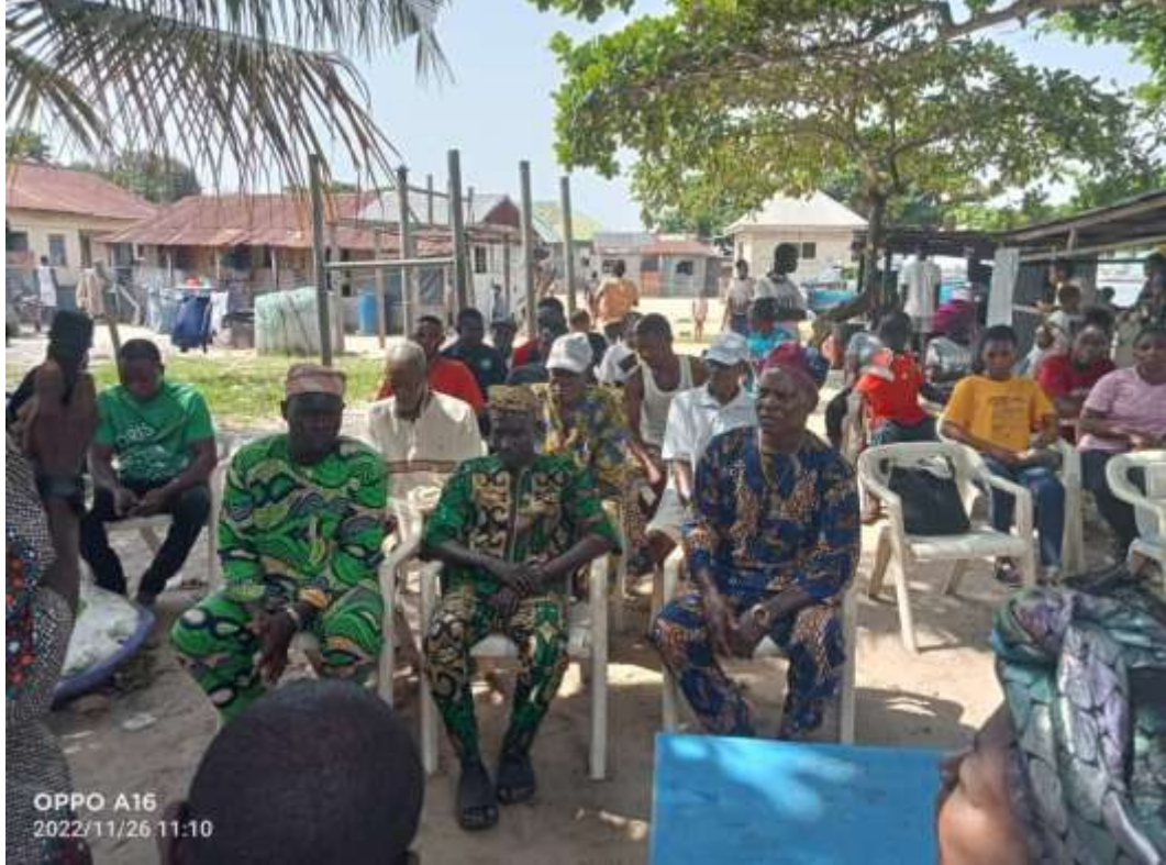
MEMBERS OF THE COMMUNITY DURING THE CHAT SESSION