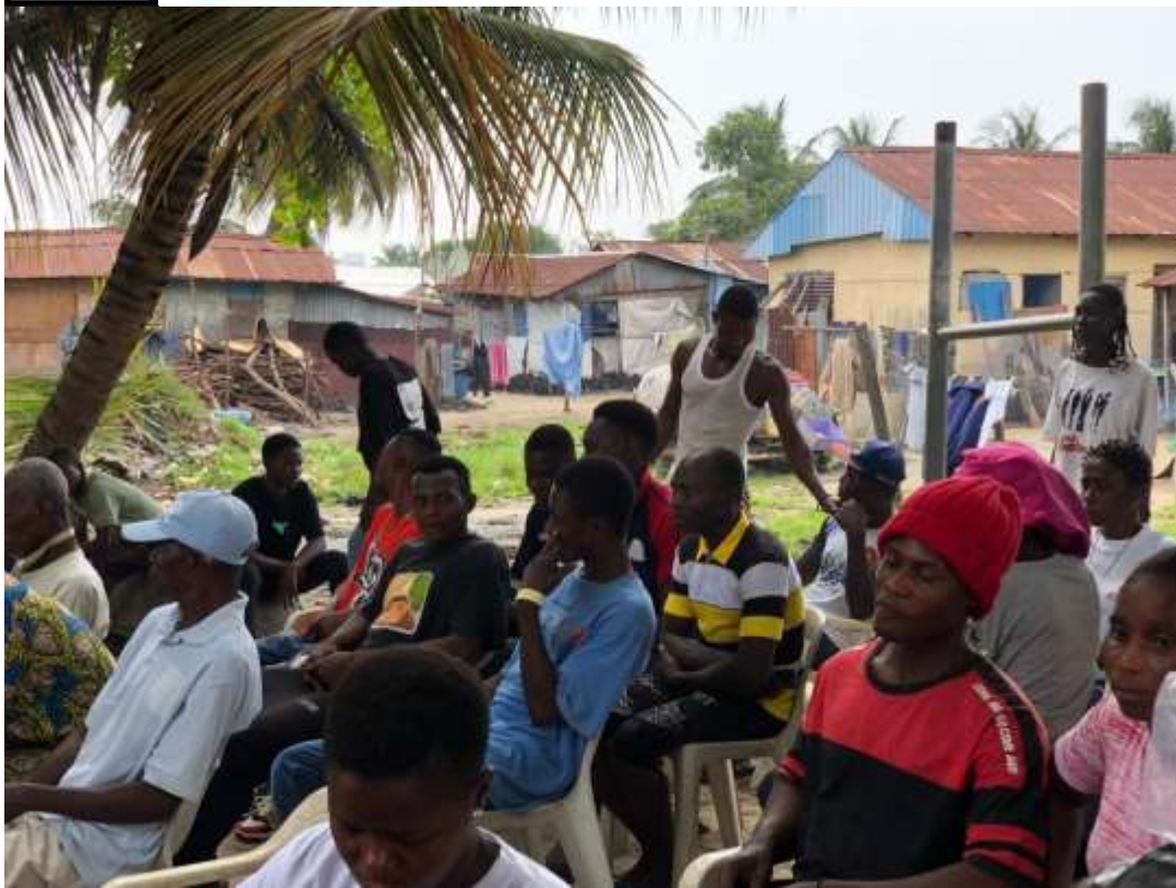
MEMBERS OF THE COMMUNITY DURING THE CHAT SESSION